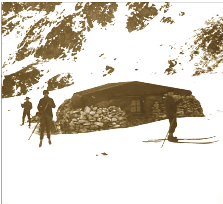
Omond House, the hut on Laurie Island from Bruce's Scotia expedition.

♥ This edition of 100 copies was issued by The Erebus & Terror Press, Jaffrey, New Hampshire, for those attending the SouthPole- sium v.4, Dublin, Ireland, 7-9 June 2019.